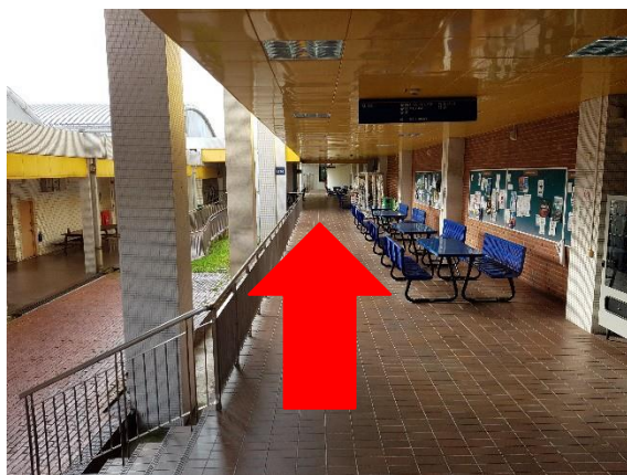
5. Continue walking straight