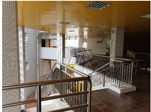
4. Take the stair down