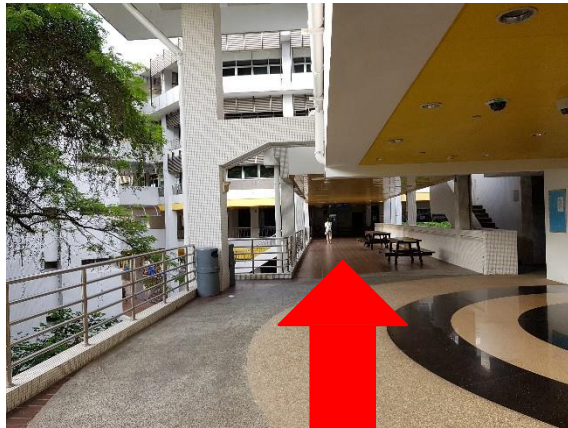
3. Turn left after exiting the lift