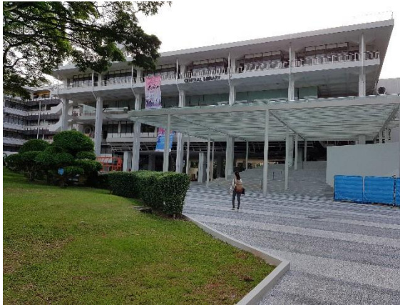
1. Walk toward NUS Central Library building