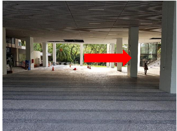
2. Walk through the atrium and take the lift to level 4 (Central Library Level)